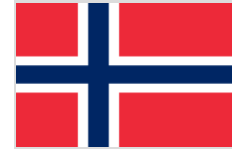
Government of Norway