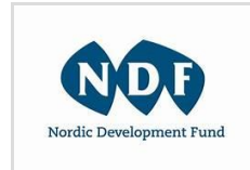
Nordic Development Fund