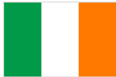
Government of Ireland