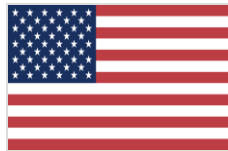
Government of United States of America